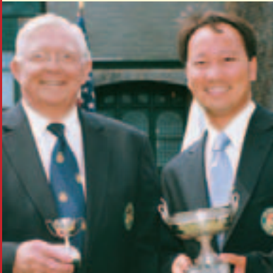
Roland Garros Champions: Tony Trabert captured the French title in 1955, and it would be 34 years before an American would hoist the trophy again. In 1989 Michael Chang prevailed as the youngest man to win a Grand Slam event. Pictured are Trabert and Chang with their individual French trophies.