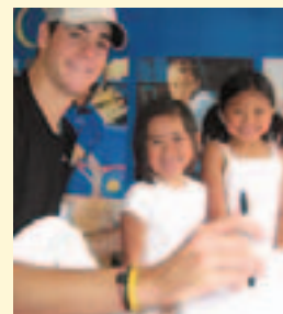
ATP Pro John Isner spent time during the tournament signing items and taking pictures with fans.