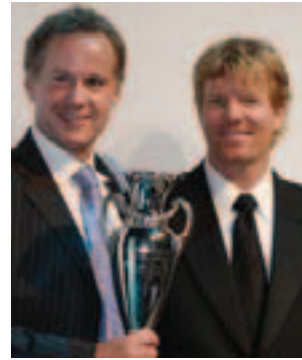
Patrick McEnroe received the 2008 William Johnston Award from Jim Courier