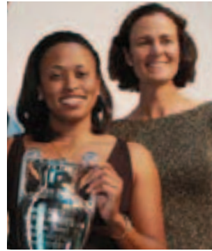
Chanda Rubin received the 2008 Allison Danzig Award from Pam Shriver