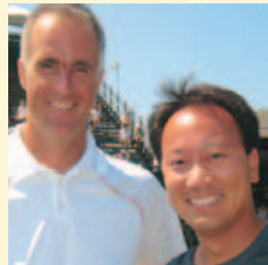
Former ATP Pro Todd Martin took on Michael Chang in the Hall of Fame Classic on Center Court.