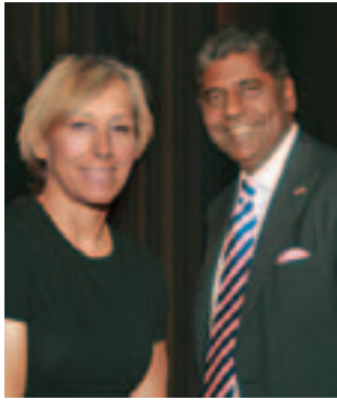
Martina Navratilova with Vijay Amritraj