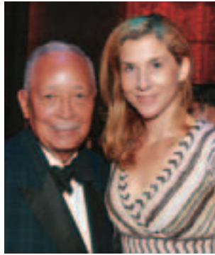
Former New York mayor David Dinkins with Monica Seles