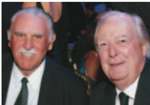
Owen Davidson and Fred Stolle share some laughs.

This year's Legends Ball at Cipriani's 42nd Street hosted over 600 guests for a spectacular evening in Manhattan. All were on hand to honor the Induction Class of 2008—Michael Chang, Mark McCormack, and Eugene L. Scott. Sony Ericsson received the Joseph F. Cullman Award and Billie Jean King the Eugene L. Scott Award. The 28th annual Legends Ball, emceed by ESPN's Cliff Drysdale raised over $300,000 for the International Tennis Hall of Fame & Museum.